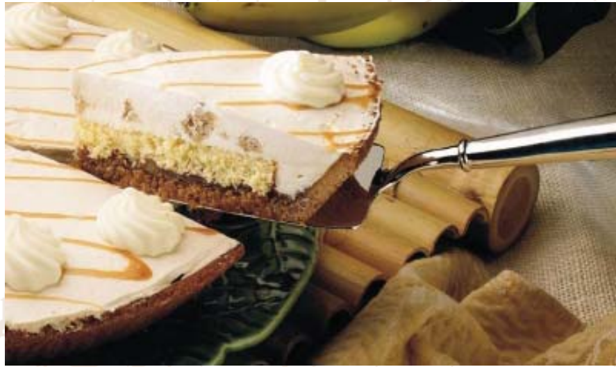
Banana Foster Pie