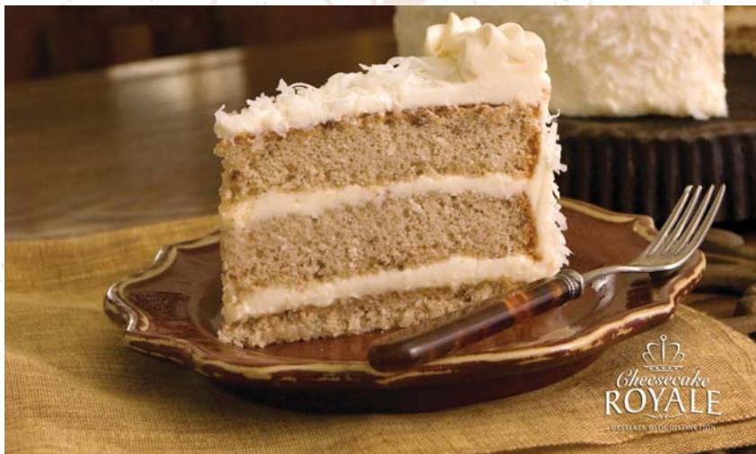
Italian Cream Cake