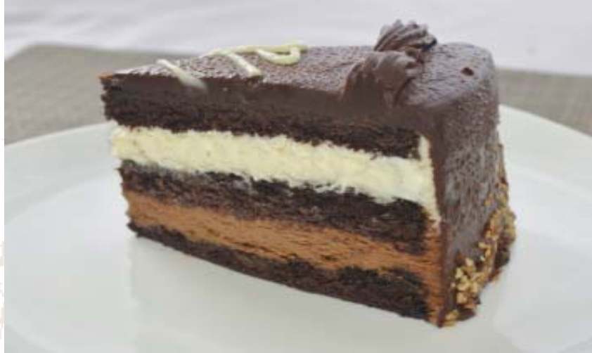
White & Dark Chocolate Mousse Cake