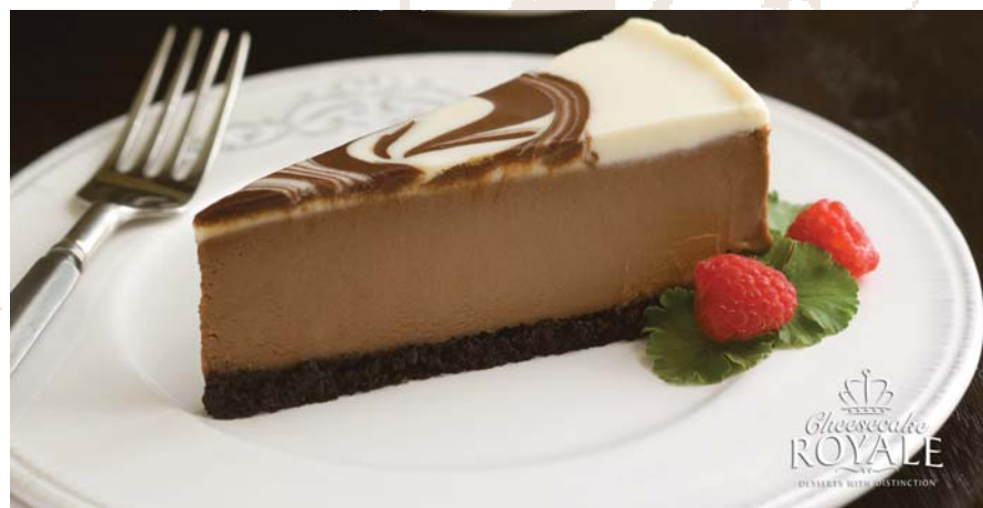
Triple Chocolate Cheesecake