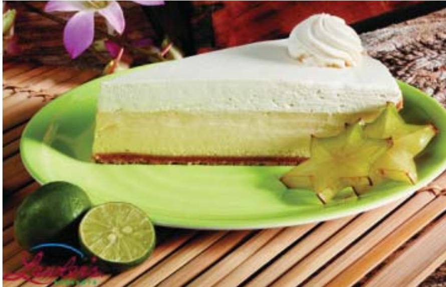
Key Lime Pie